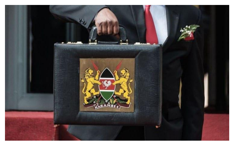
KENYA – Let Us Take the Government Budget Estimations Seriously

While the COVID-19 pandemic struck and is still ravaging the entire world, tax dodgers are intensifying their tricks to steal more and more from the poor. This is increasing the inequality gap plus negatively impacting developing countries like Burundi. <u>Read</u> More