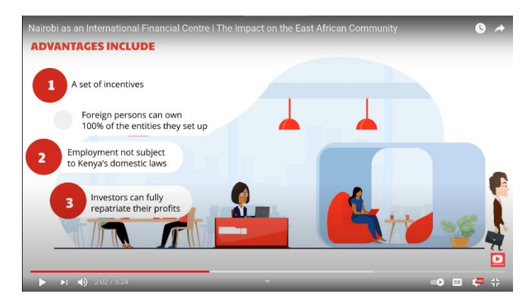
Nairobi as an International Financial Centre | The Impact on the East African Community

What are International Financial Centres (IFCs) and why do they matter?